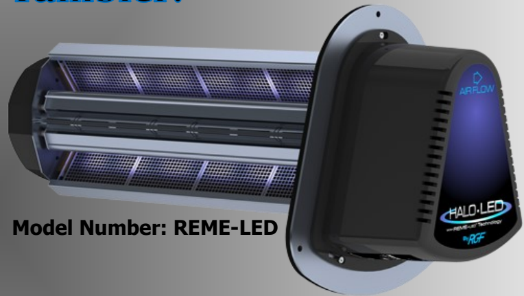
Model Number: REME-LED